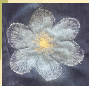
Patched up jeans

Pam mends clothes for a small fee that is donated to Dundee Women's aid.