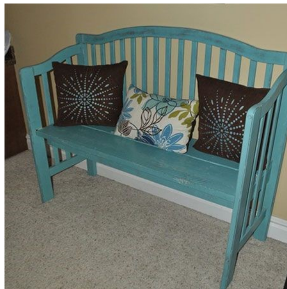
A baby cot upcycled into a comfy seat

We will be having some fun with upcycling clothes this autumn to stop them going to landfill. We will continue with Pam's wonderful and very popular introduction to sewing machine courses and clothes repair skillshares. As ever we would also like to seek out your hidden talents so if you have any clever ideas on what to do with old